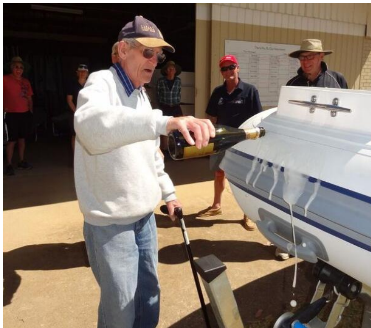
More photos from our season launch and long lunch on Sunday 7 th October 2018.